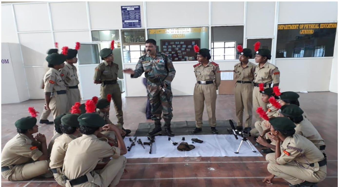
22 MAH N.C.C. Battalion, Satara Army officers giving weapon training to NCC cadets